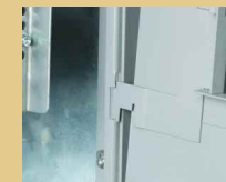
Trim Hanger Inserted Into Box Flange