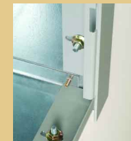
Corner Flange Detail