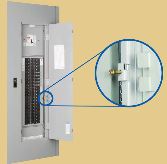
Trim Installed with Door Open and Trim Sliding Latch